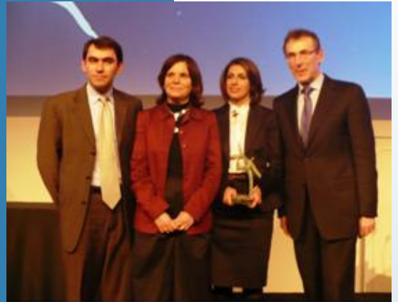
The Award is distributed by Andris Piebalgs, European Commissioner for Energy (right) in the category cooperation programme to the RENDEV Team

According to Jacques Attali, PlaNNet Finance's Chairman, "the jury selected a project that could be perfectly adapted to other countries. More than ever, with the deep crisis the world is going through, microfinance is an essential tool for the poorest populations."