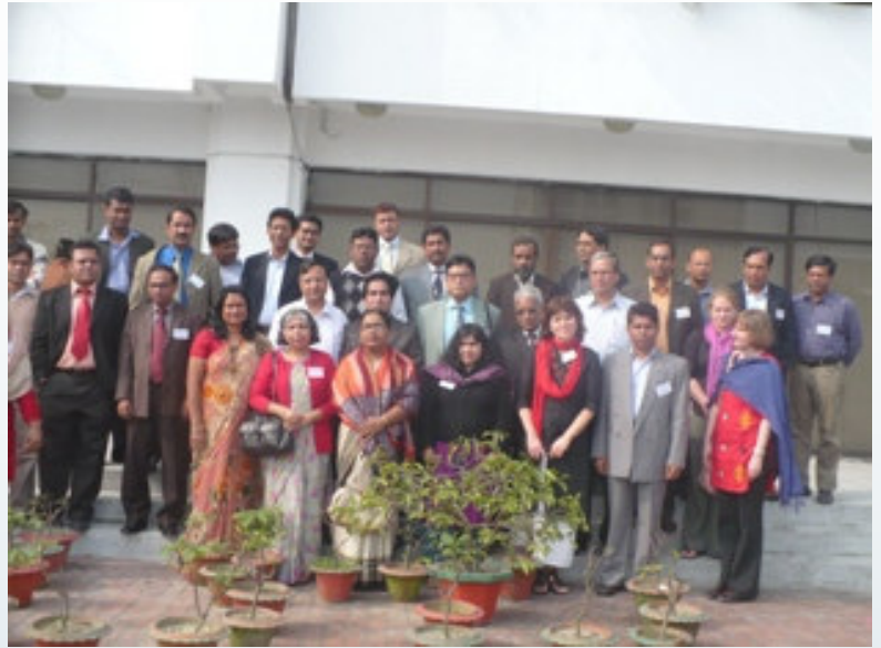
RENDEV National Conference in Dhaka, Bangladesh

PlaNNet Finance, Grameen Shakti, Rural Services Foundation and REDI have designed a comprehensive project aiming to analyze the current operations of the partners, reinforce their capacity to develop new products (technical and financial) and manage different product lines, and implement new business lines to respond to the needs of the Bangladeshi populations who are energy poor.