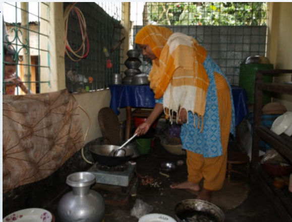
Woman cooking with bio-gas, Bangladesh

RENDEV projects aims at benefiting from the experience of microfinance actors in providing services to poor populations to develop national schemes promoting the use of renewable energies for those who are lacking access to the electric grid.